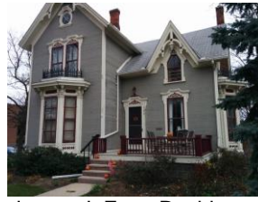
James J. Frost Residence 1874 Victorian Gothic

Wide stairs lead up to a beautiful second floor apartment that overlooks North Main Street. Exposed brick work shows the original building. Look up and see the old ceiling rafters, all painted black. What a great place to view the annual Romeo Peach Festival.